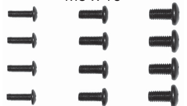
PM-04-B M4 x 16